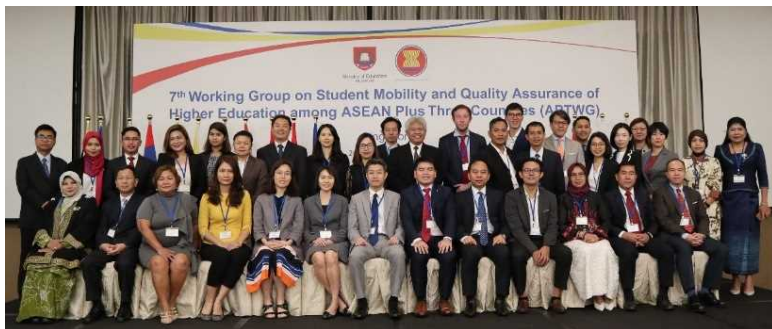
7 th WG meeting, September 2019