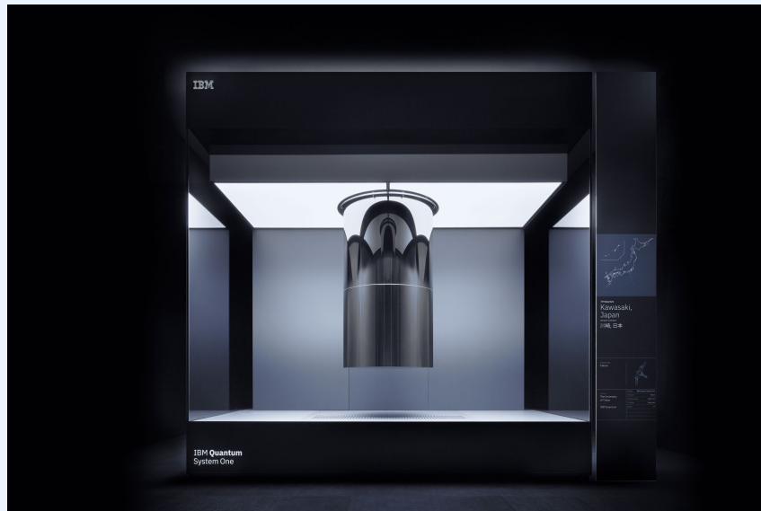
IBM Quantum System One “Kawasaki”