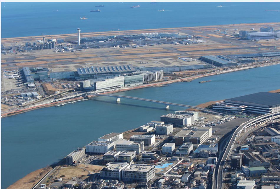
Figure 1-2-1/KING SKYFRONT, Tonomachi International Strategic Zone