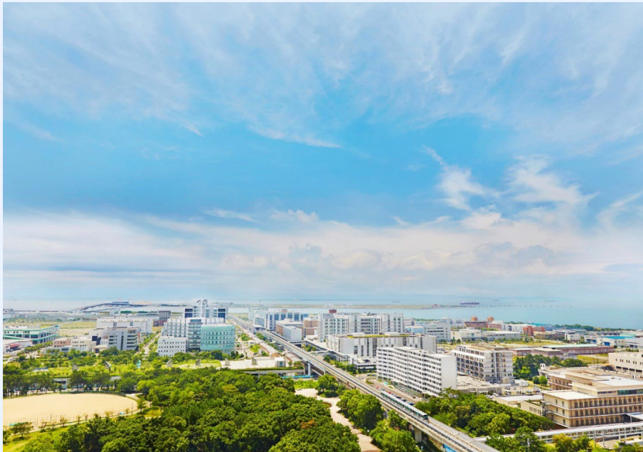
■ Figure 1-2-4/Bird's - eye photo of the KBIC