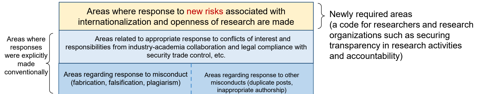
Figure; Overall structure of research integrity