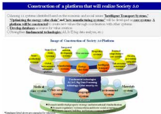
Outline of service platform

The Ministry of Internal Affairs and Communications (MIC) is promoting R&D of ultra-realistic image technologies 2 conducted by private businesses as Hospitality Systems in preparation for the Tokyo Olympic/Paralympic Games in 2020. MIC has been working to further improve the accuracy of the technologies through development of noise suppression technology essential for use of multi-lingual voice translation systems and assessing performance in actual scenes of use including hospitals, commercial facilities, railways and taxis. In fiscal 2017 their use was demonstrated in four tourist destinations, etc. across Japan. R&D of other systems is also conducted in cooperation with the government departments.