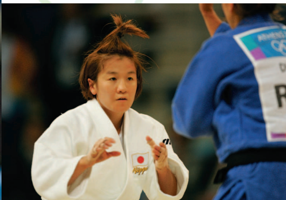
Ryoko Tani, women's judo 48-kg gold medalist, won her second consecutive gold medal following the 2000 Sydney Olympic Games.