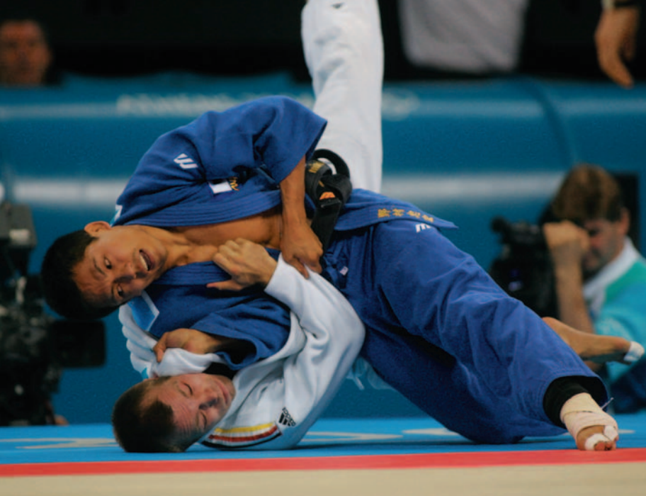
Tadahiro Nomura, men's judo 60-kg gold medalist, became the first judo man to win a third consecutive gold medal at the Olympic Games.