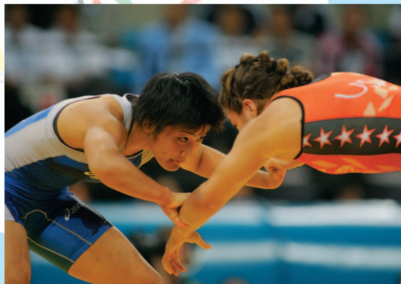
Kaoru Icho, women's 63-kg wrestling gold medalist