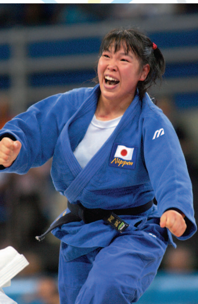
Noriko Anno, women's judo 78-kg gold medalist, finally won the gold medal at her third Olympic Games. Under the slogan of "efforts will never betray," she overcame the hardships she had at the two previous Olympic Games and finally won the gold medal.