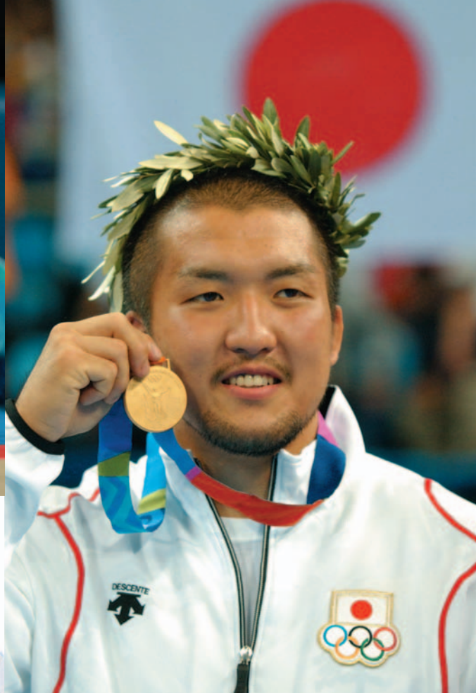
Keiji Suzuki, men's judo +100-kg gold medalist, bringing back the men's +100-kg gold medal to Japan for the first time in 16 years since the 1988 Seoul Olympic Games "I am in the fullness of my heart. It was the last day for judo, and I had a sense that my mission was to do my best also for my comrades who lost the matches. I thought I should fight squarely."