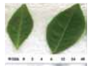
Elicitor effects induced by rare sugars