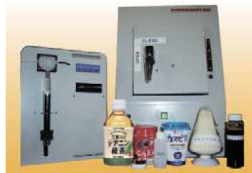
The part of research the result (including samples and products under development)

The sugar-chain related researches conducted by local universities are also to be advanced to create new business opportunity for chemical products such as reagents.