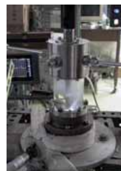
High frequency in-liquid plasma generator

By using this device, harmful substances feared as an environmental problem such as emission of fluorocarbon, dioxin, and PCB can be decomposed and be made harmless more than conventional method, since it does not depend on this type of the liquid and the plasma can be generated in a variety of liquids.