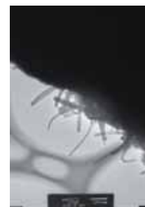
TEM photo of carbon nanotube