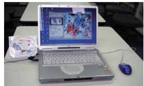
Multifocus display software

Although digital imagery is fully utilized for the pathology research in the United States as well as Europe, such digital images are rarely useful in the field because it requires long time to obtain such image in Japan. In this research and development, the system, in which it is possible to efficiently incorporate the image data of wide area into the computer has been developed and has been applied to optical microscope. A program, multifocus displaying software with virtual-microscope, which enabled us to viewing digitized data as real microscope image has also been developed. This technology has possibility to replace microscopic analysis with digitized images.