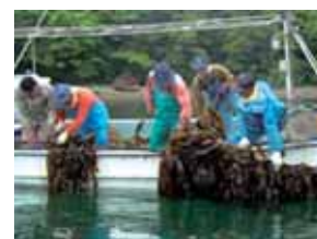
New activities for seaweed cultivation

In Ashikita region, the fishery workers and high school students in the regions try to increase the alga "Amamo". They grew the seeds to collect in summer for germination, planting and transplanting.