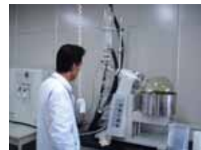
Development of technology to separate and refine functional components from seaweed and biomass

A technology to separate and refine polysaccharides related to alga is developed. The analysis for the contents and rheological analysis were conducted to study its effective use.