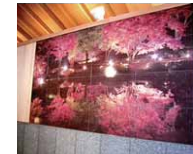
Decoration tiles on the wall of the building in Badenpark-SOGI (Sogi, Toki City), (two fluid nozzle)