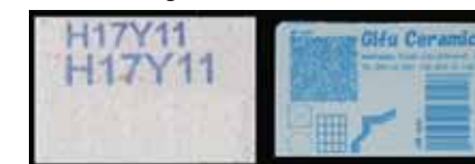
Direct marking print by piezo nozzle on the refractory