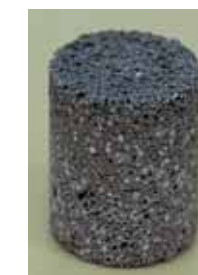
Electrically conductive porous ceramics