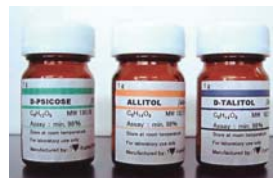
Being sold reagents of rare sugars, including D-psicose