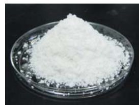
D-psicose: The first candidate for functional foods

It was found that rare sugars (D-psicose, D-allose) have activities to control the growth of plants as well as enhance their anti-pathogenic activity (elicitor activity). The research to develop the novel agricultural chemicals which are friendly to human and environment using their functions started using the research fund of the Ministry of Agriculture, Forestry and Fisheries.