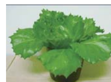
Chloroplast transgenic lettuce

Using technology to genetically engineer chloroplasts in leafy vegetables (lettuce), we were able to produce a tetanus vaccine, which is an inactivated toxin (protein), thereby establishing basic technology including applications for basic patents. This technology has now been forwarded to the METI-supported project "Production of human Thioredoxin-1 protein in lettuce chloroplasts featuring collaboration among medical, agricultural and engineering fields."