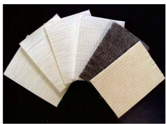
Photocatalytic mats with various characteristics

We developed the mass spectroscopy ionization reagent KHM-01, which enables the safe, highly sensitive, highly selective, and easy identification and quantitative determination of multiple heavy metal ions.